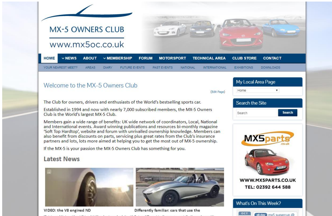
The "new" home page for the MX-5 Owners Club